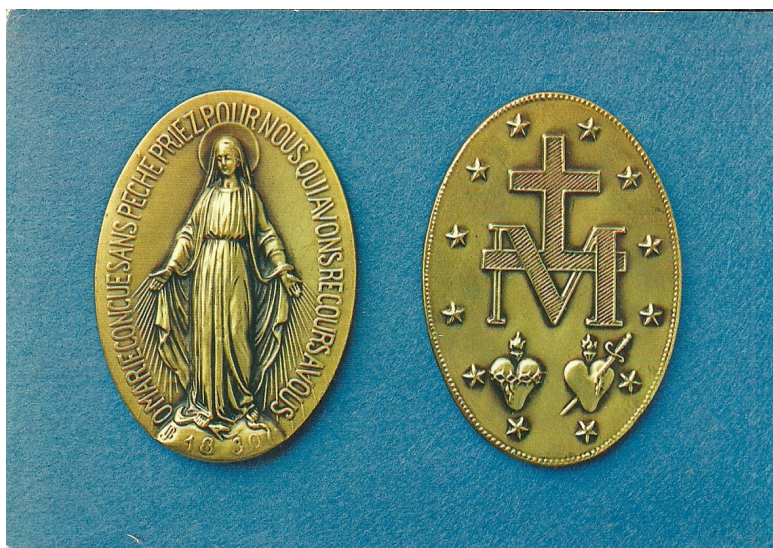
The Miraculous Medal